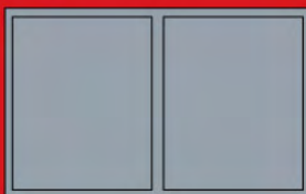
DPS Trim. 46x27.5 cm Bleed. 47x28.5 cm