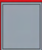
Full Page Trim. 23x27.5 cm Bleed. 24x28.5 cm